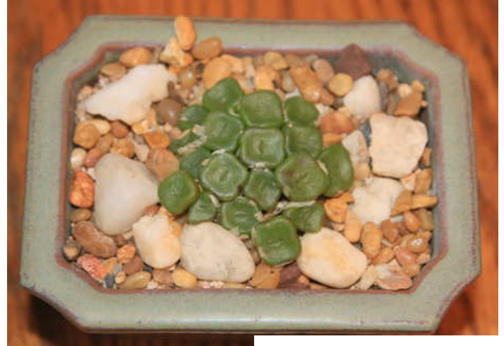
2nd Jeff Sedwin Conophytum cubicum